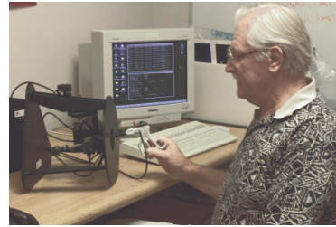
Figure 2. The user holds a haptic device that resembles a conventional surgical laparoscopic tool.

This application uses a TCP connection to exchange setup information but then exchanges haptic data using UDP packets. The UDP packets are unreliable but because of the latency requirements of the application, retransmission of lost packets has little value. Unlike the JPEG server, the AutoHandshake is a low-bandwidth application, using only up to 128 Kbps.