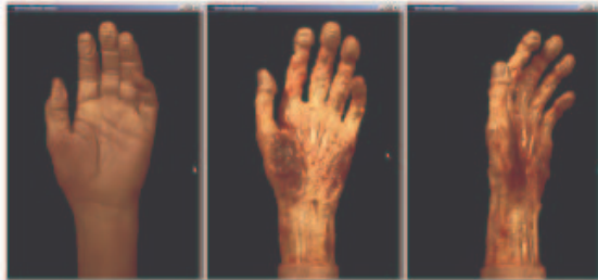
Figure 1. Images of the dissected hand. a) the fresh cadaver hand. b) the dissected hand with skin and fat removed. c) the same dissected hand, rotated.

The client and server use a TCP connection to exchange information about the image set contents and to communicate requests. The actual transport of image data is handled using a reliable UDP layer protocol that supports recovery of lost packets. Image decompression at the client occurs in parallel with image transport. The image transport rate is controlled to be comparable to the image decompression rate. The transport produces bursts of 30-40 Mbps. The UDP layer implementation allows image data to be transported over a multicast address to multiple collaborating clients and voids some overhead of the TCP layer.